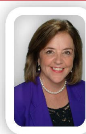
Your Church Music Director

Each Office is Independently Owned and Operated.