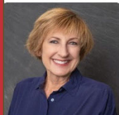
Parish Council Secretary