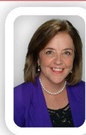
Your Church Music Director

Each Office is Independently Owned and Operated.