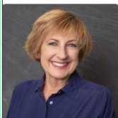
Parish Council Secretary

Estate Planning and Real Property attorney serving Lake Tahoe. Call for a free consultation.